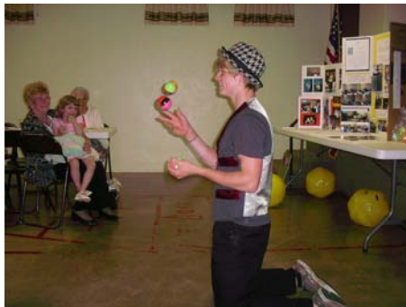
Scene from the Mother/Daughter Tea